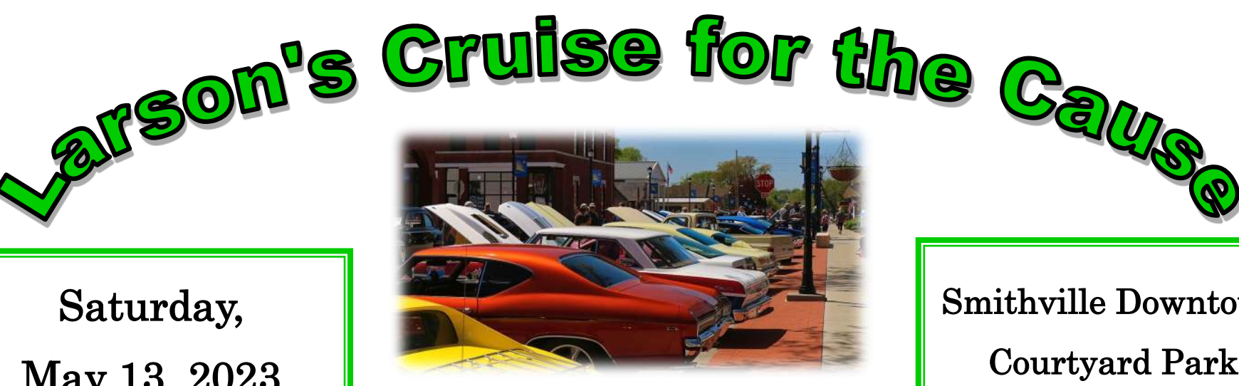
Larson's Cause is a non-profit organization 501 (c)(3) that assists local children by providing financial assistance for their medical needs

Live Auction begins at 4:00 p.m. Awards immediately following