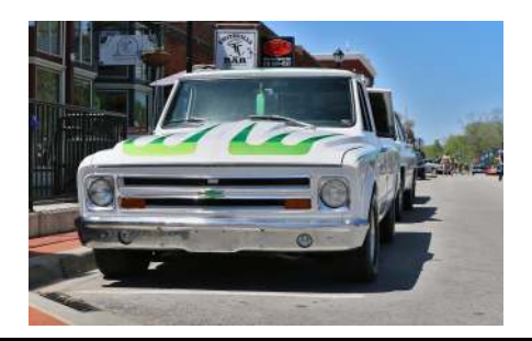
Registration from 1:00 – 3:00 p.m. Judging from 2:00 – 3:00 p.m. Silent Auction ends at 3:45 p.m. Pickup at 4:15 p.m.

Live Auction begins at 4:00 p.m. Awards immediately following